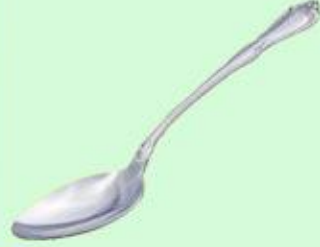
च Ch as in C huck चम्मच Chammach (Spoon)