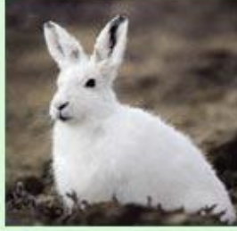
ख Kh as in K han खरगोश Khargosh (Rabbit)