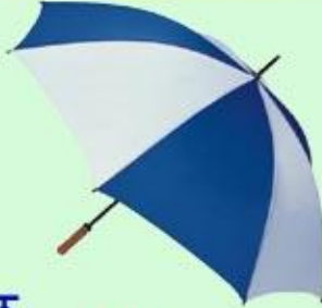
छ Chh छतरी Chhatri (Umbrella)