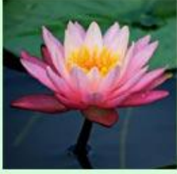
क K as in K angaroo कमल Kamal (Lotus)