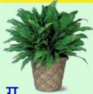
ग G as in G um गमला Gamla (Pot)