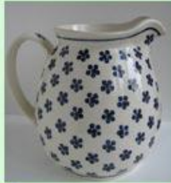
ज J as in J ug जग Jug (Jug)