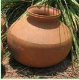
घ Gh as in G host घड़ा Ghara (Pot)