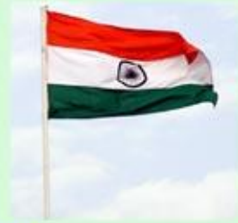
झ Jh झन्डा Jhanda (Flag)